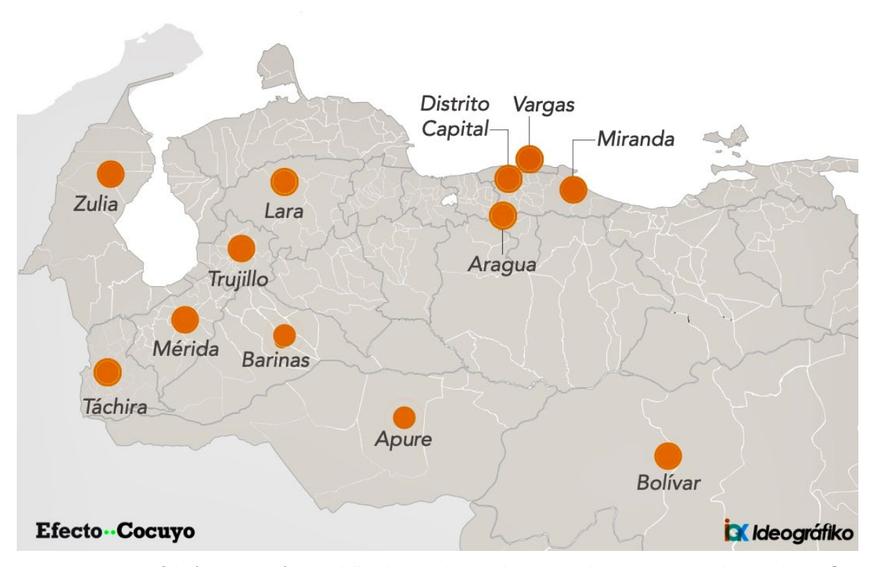
Map 7: Presence of the 'peace crews' or cuadrillas de paz , otherwise known as colectivos , in Venezuela, 7 April 2019 © Efecto Cocuyo/Ideografiko<sup>1055</sup>