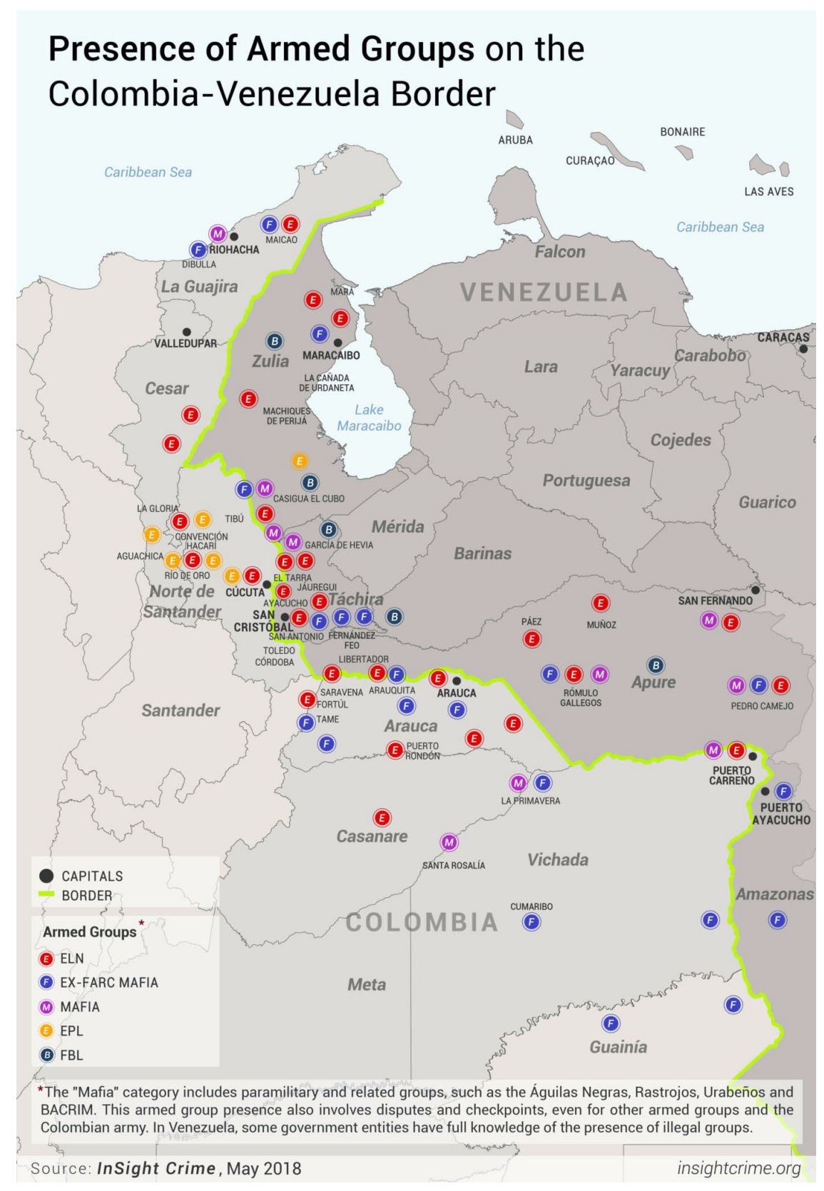
Map 4: Presence of armed groups on the Venezuela-Colombia border in 2018, May 2018<sup>728</sup>