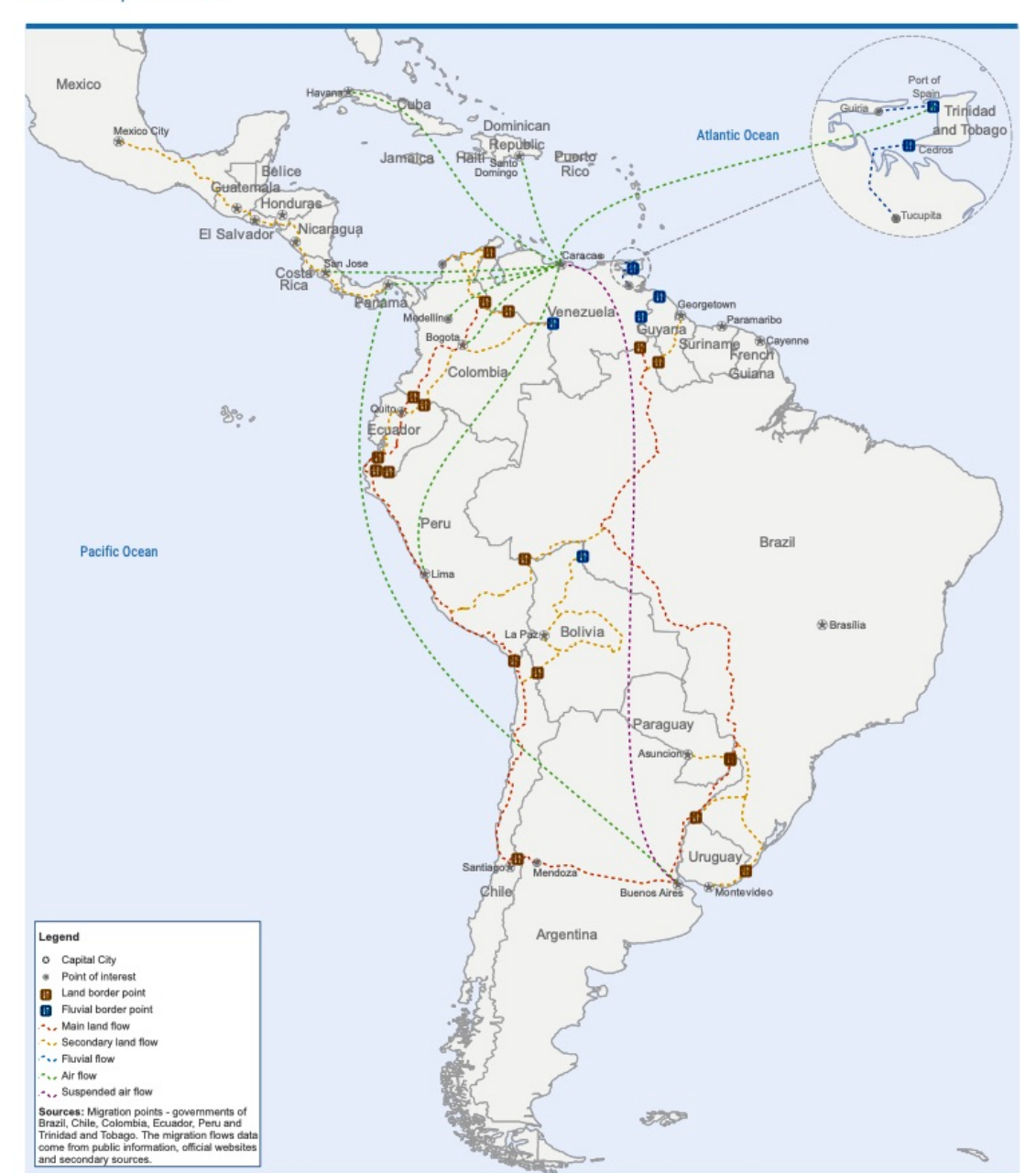
Map 3: Migratory routes followed by Venezuelans in the region, 18 September 2018 2 OCHA-ROLAC 341