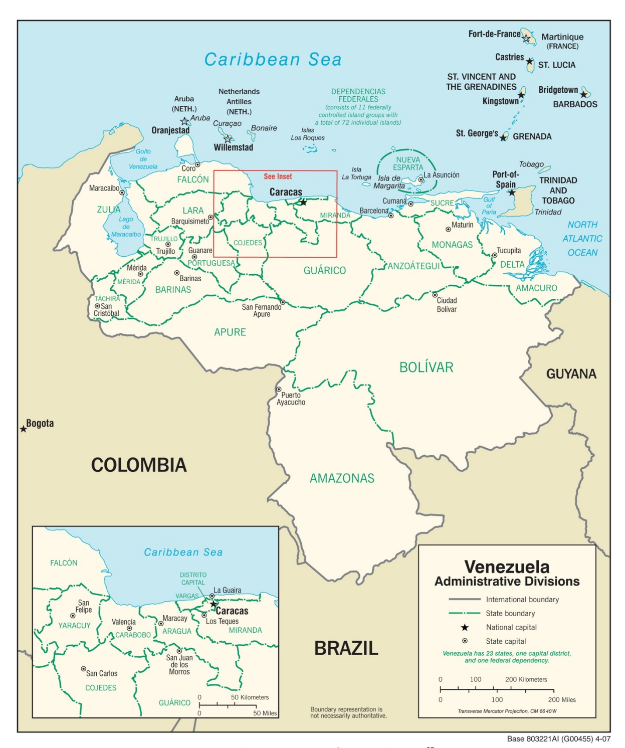
Map 1: Administrative map of Venezuela. ^{27}

^{27} Venezuela Administrative [map], in: US, CIA, Venezuela Administrative, 2007, \underline{\text{url}}