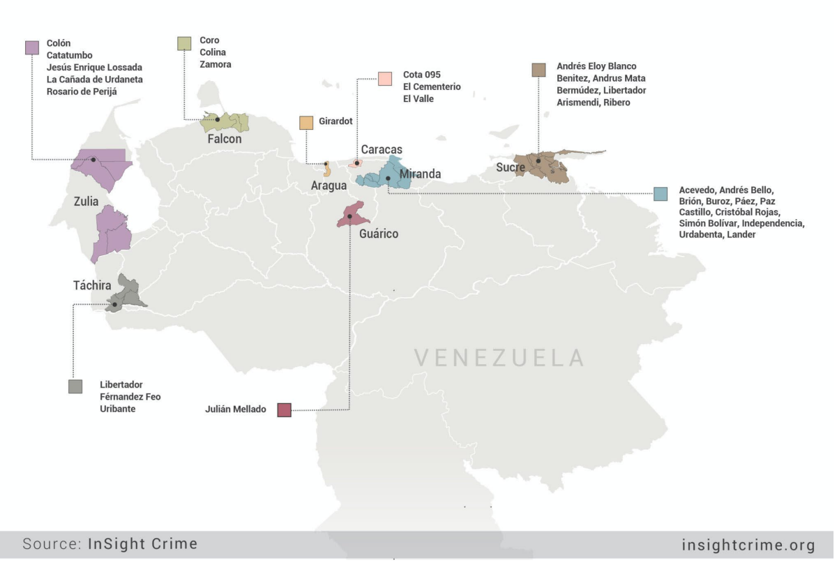
Map 6: Peace zones in Venezuela in 2018 ©InSight Crime CC BY-NC 3.0968