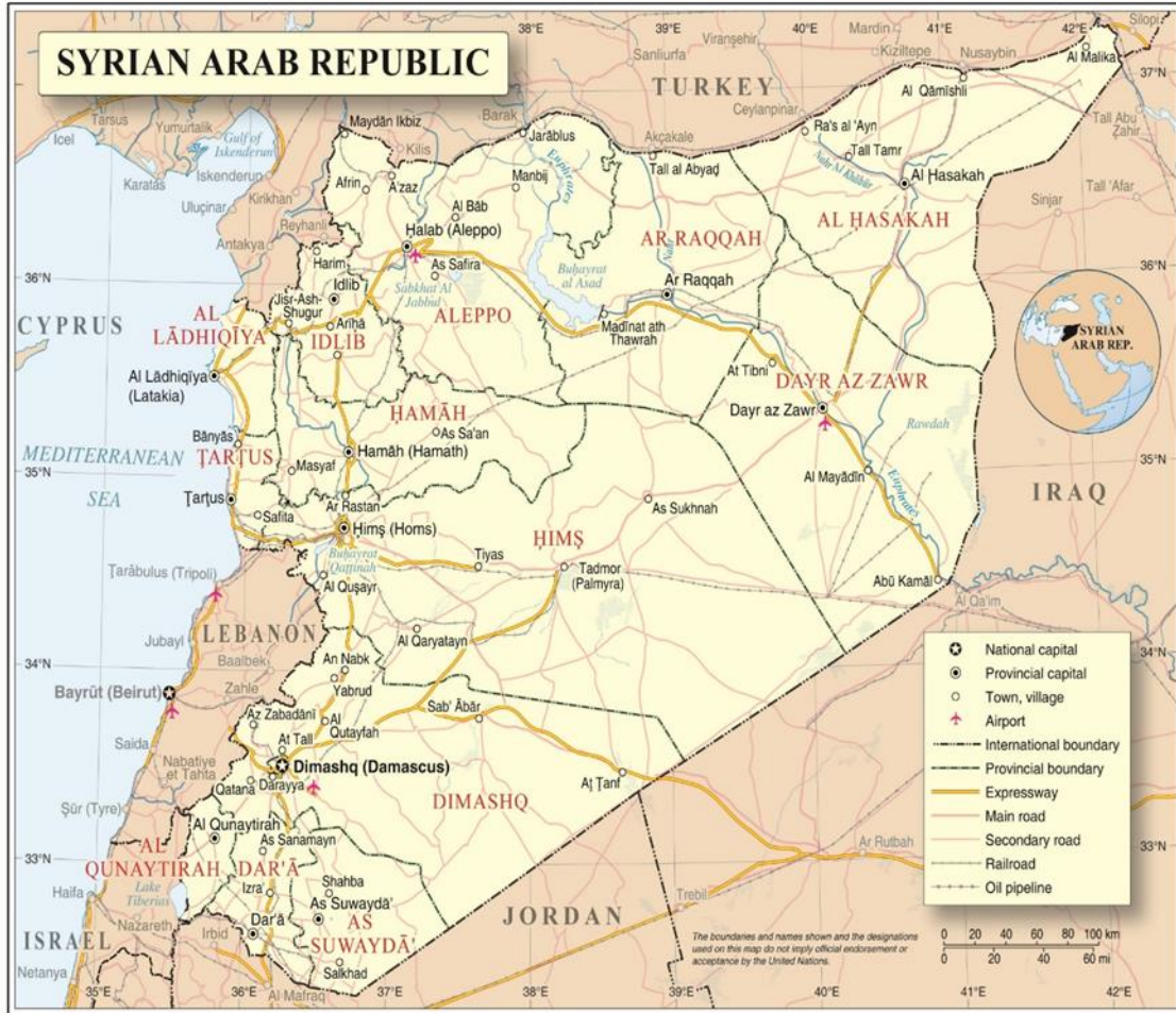
Map 1: Syria 5