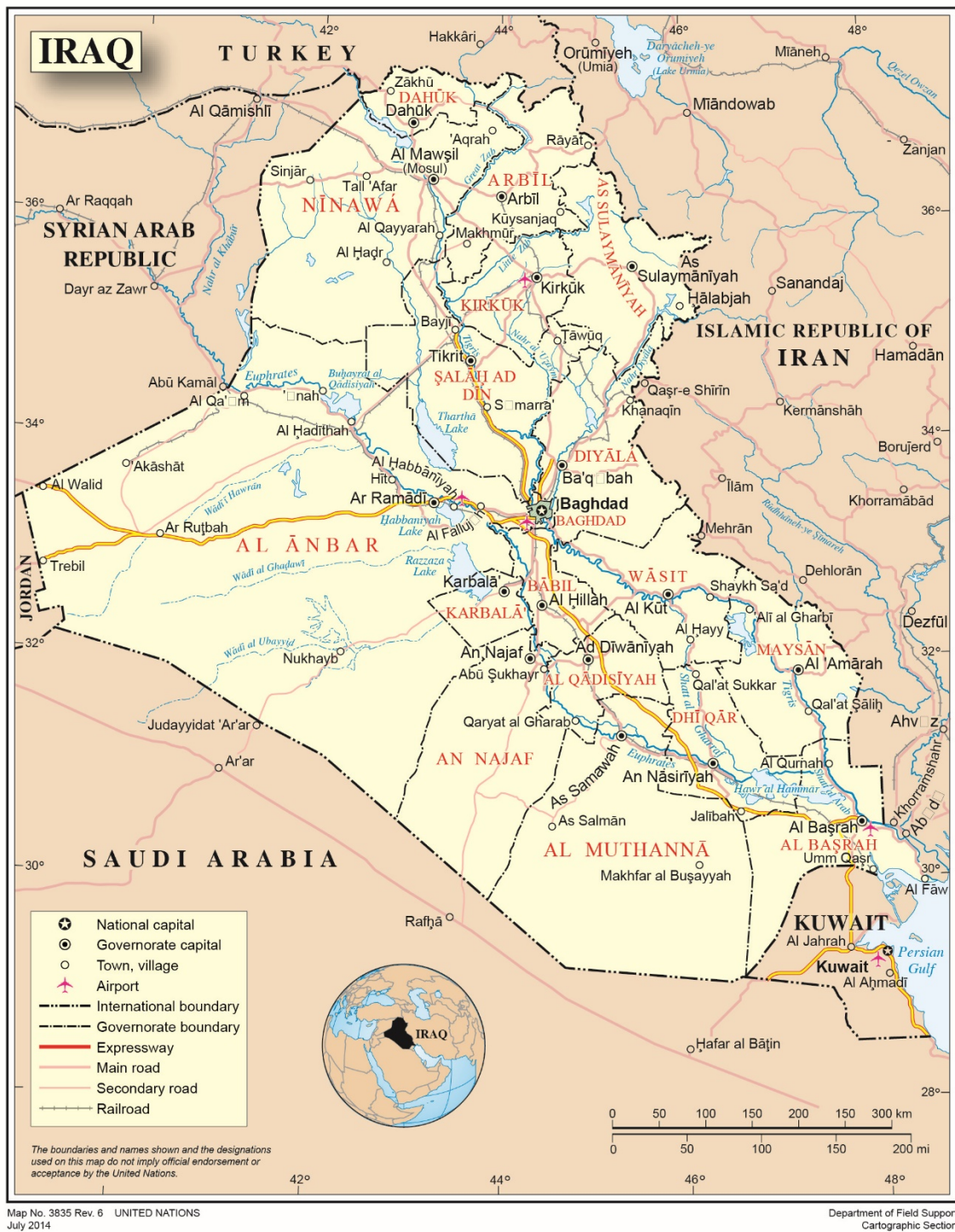
Map: UN, Iraq - Map No 3835 Rev. 6, July 2014, ( url ).