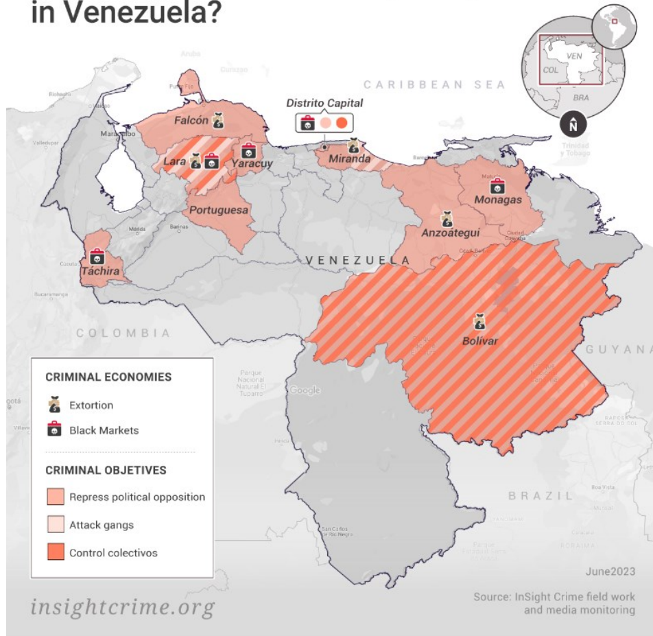
Map 3. Presence and activities of the CUPAZ 355

A research report produced by the UCAB, based on a survey conducted among victims of displacement by colectivos , indicated that the profile of victims of colectivos is diverse, and includes high school and university students, professionals, and business persons, mostly men, and that threats and other violent activities often extend to family members, including children. 356 Most incidents of targeting by colectivos were due to political motivations, including participation in, or support of, demonstrations; support of political opposition parties; and criticism of the government. 357 Additionally, business persons and manufacturers who are critical of the government are subjected to extortion, theft of their products, and attacks