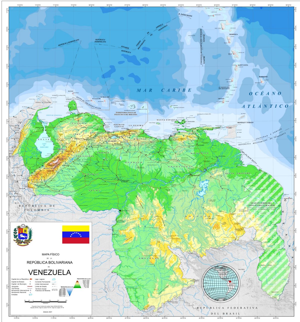
Map 2. Official Map of Venezuela. 6