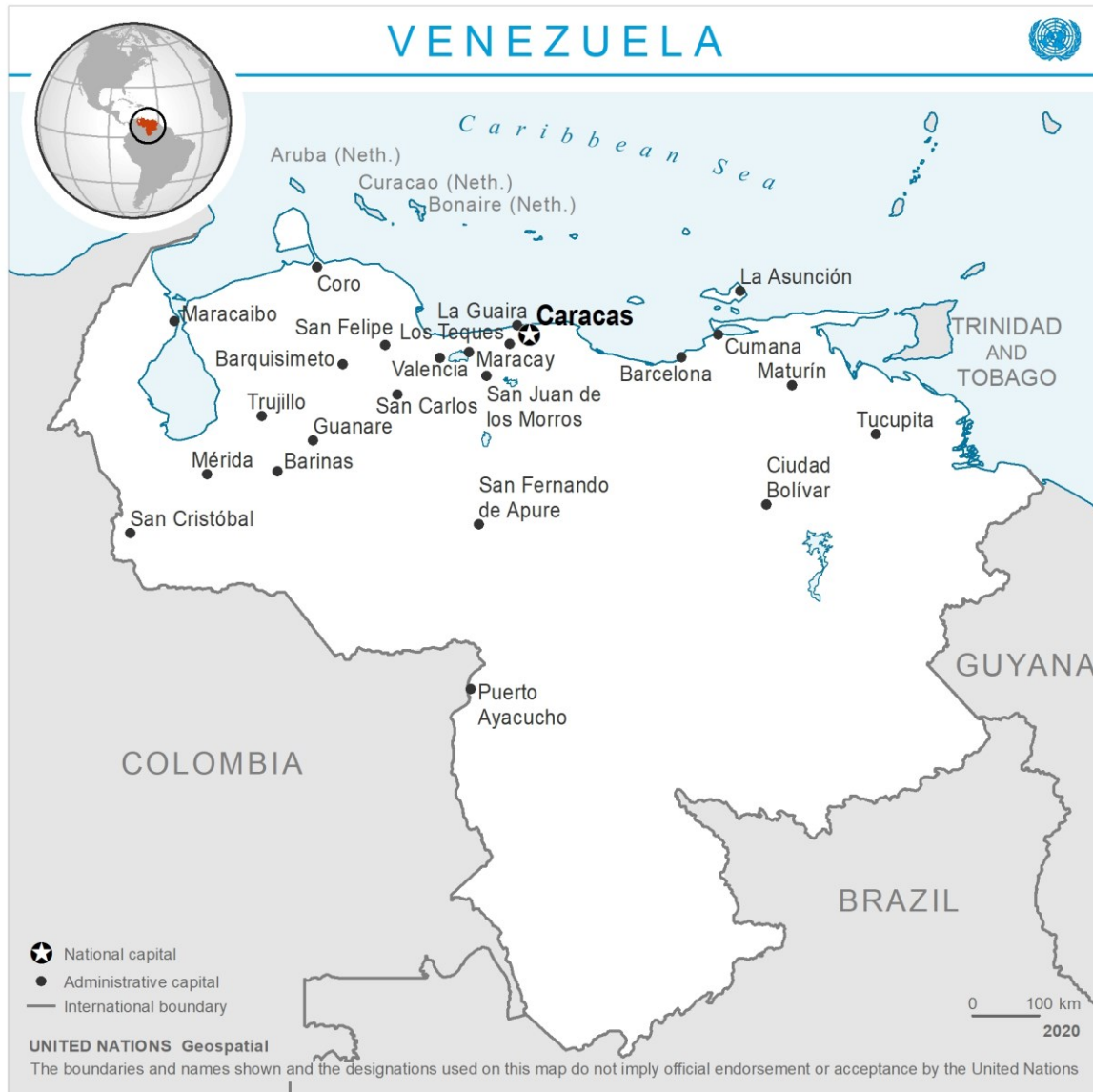
Map 1. Venezuela. 5

Two maps of Venezuela are provided below. A UN map of Venezuela from 2020, as well as the 2021 official map of the Venezuelan government. Venezuela considers the Esequibo region, which is administered by Guayana, as Venezuelan territory, as shown on the second map. 4