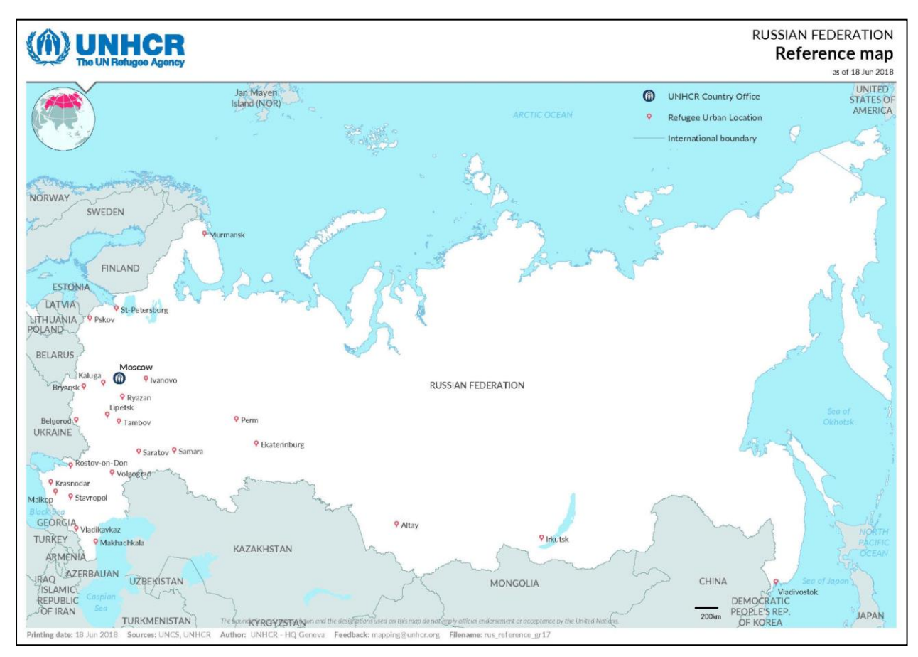
Figure 1: Map of the Russian Federation.8