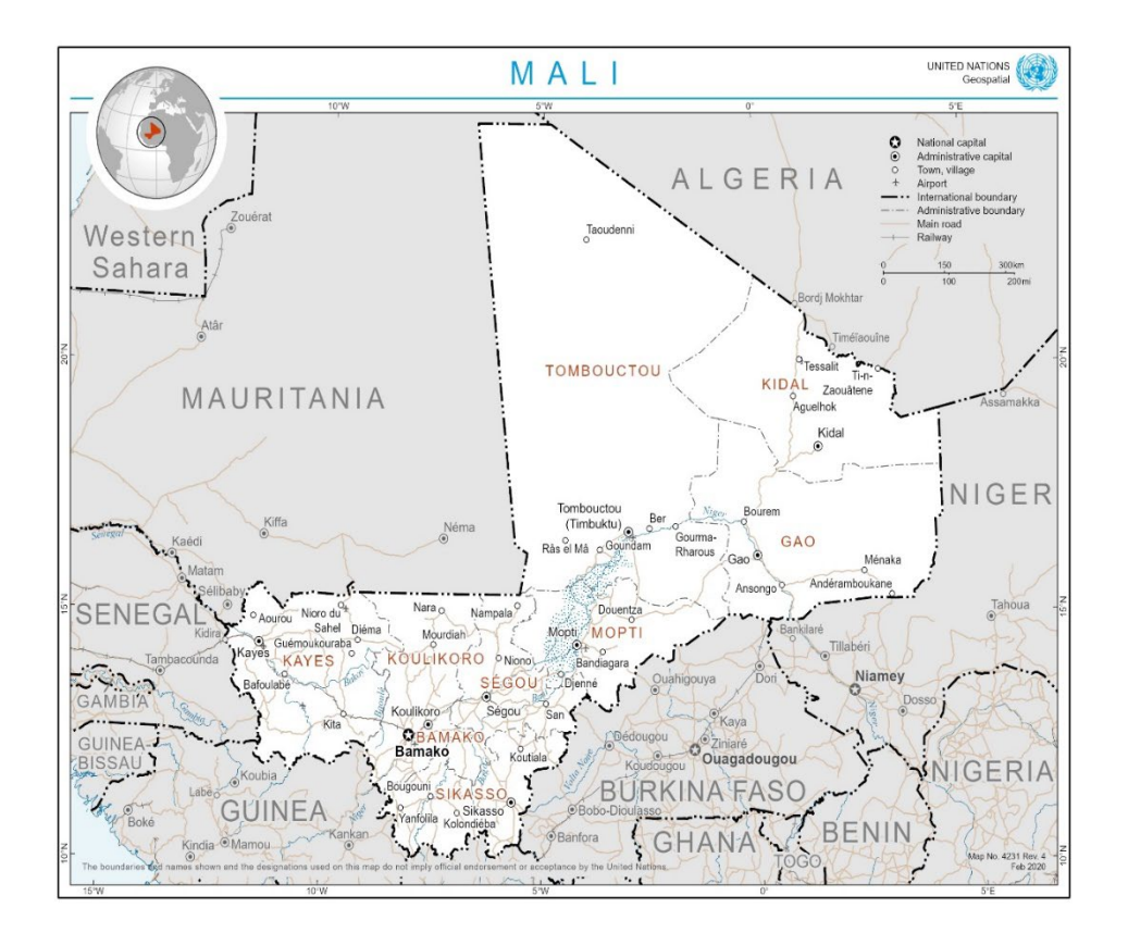
Figure 1. Map of Mali

UN, Mali - Map No. 4231 Rev. 4, February 2020 url